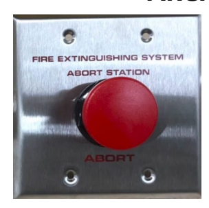
Abort Station (AW-1)