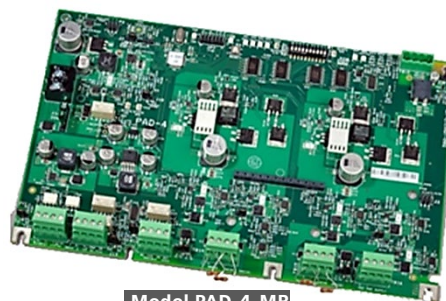
Model PAD-4-MB Main Board