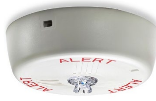
Model SLSCW-AL Strobe