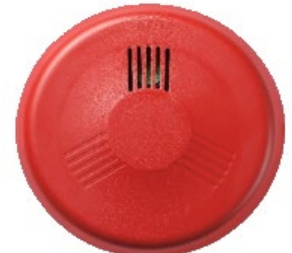
Model SLHCR-N Horn