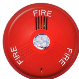
Model SLHSCR-F Horn-strobe

This `SL'-series is exclusive to indoor ceiling-mount applications. The Model `SLHC'-series horn appliances work in either 12V or 24VDC, whereas the Series `SLSC' and `SLHSC' strobe and horn-strobe devices are specifically for 24V operation.