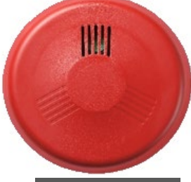
Model SLHCR-N Horn