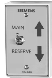
Main / Reserve Selector Switch (CPY- MRS)