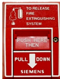
Manual Release Station (MH-501)