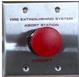
Abort Station (AW-1)